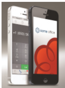
Ooma Office Mobile HD app