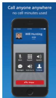
Talkatone App Calling