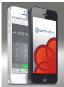
Ooma Office Mobile HD app